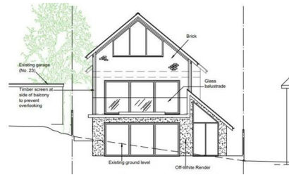
Front Elevation (North West)