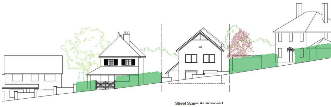
Street Scene As Proposed