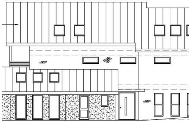
Section AA (North East) / Section AA As Proposed